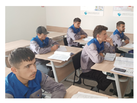
Students learning the basics of electronics.

Within the framework of the UCA SPCE Local Impact: A Transformative Partnership in Asia and Africa, in July 2022, a technical training for the preparation of specialists in repair of household appliances, cell phones and IT