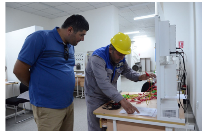
A trainee electrician demonstrates his new knowledge.

To enhance local capacity to design, implement, and manage renewable energy resources, UCA's SPCE in partnership with AKF and USAID's Local Impact project designed and piloted certified technical training for electricians.