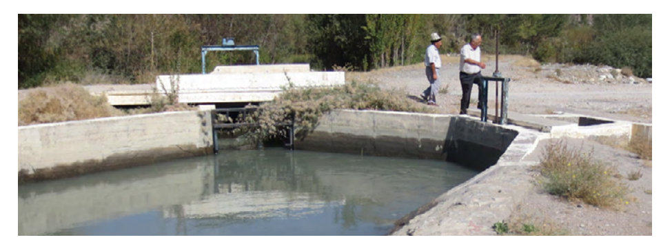
A view of the water intake structure of the Ak-Tatyr canal, Kyrgyzstan.

The paper is available for free download at UCA's website: https://bit.ly/IPPA-WP69