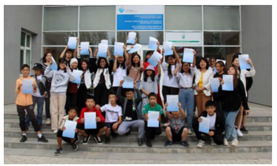
Summer School Programme students joyfully show their completion certificates.

In addition to fun and games, learning English, and performing in a Talent Show, the 85 participants, 15 of whom were from vulnerable families, worked with great interest on the tasks of mastering Microsoft Office software. During the Summer School the students increased their fluency of English, strengthened teamwork, networking, and gained leadership and soft skills. At the end of the program the children successfully passed their final exams and received certificates.