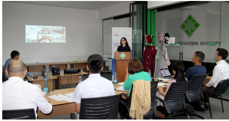
A student presenting her business ideas for a tourist guest house in Naryn.

At the Naryn Centre for Entrepreneurship (NCE), 40 participants completed the Entrepreneurship Training Program. This was the third cohort attending the entrepreneurship training program, which took place between April and June 2022.