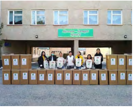
Eco Warriors prepare to distribute recycling boxes to schools in Naryn.

The Eco-Warriors Club, starting in September 2020, have conducted twoday eco-educational trainings for 120 participants and installed 288 bins in nine schools, three colleges, the Mayor's Office, and the government administration office in Naryn City. A recycling mural,