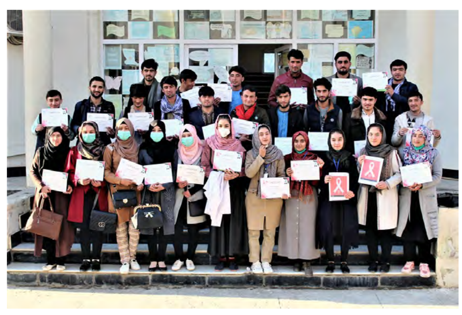
Participants of the Cancer Awareness Workshop.

The Continuing Education Unit (CEU) of UCA's School of Professional and Continuing Education learning centre in Faizabad, Afghanistan, commemorated World Cancer Day on February 4th 2021, with an awareness-raising workshop. Twenty-five students participated in the event, which was held in cooperation with the American Council Alumni and the Panexe Logistic Service Company.