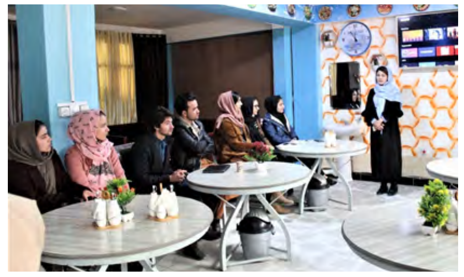
Students learn firsthand about what it takes to open a new restaurant.

The first group of Entrepreneurship Training Course students at UCA's School of Professional and Continuing Education learning centre in Faizabad, Afghanistan completed their one-month studies, and were awarded certificates of completion on February 18th 2021.