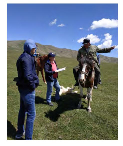
A member of UCA's team interviewing residents about the impact of mining activities near their village.

The efforts of the Kyrgyz government to develop the mining sector presents socio-political and environmental challenges that often trigger resource conflicts between communities and foreign investors. The University of Central Asia's Institute