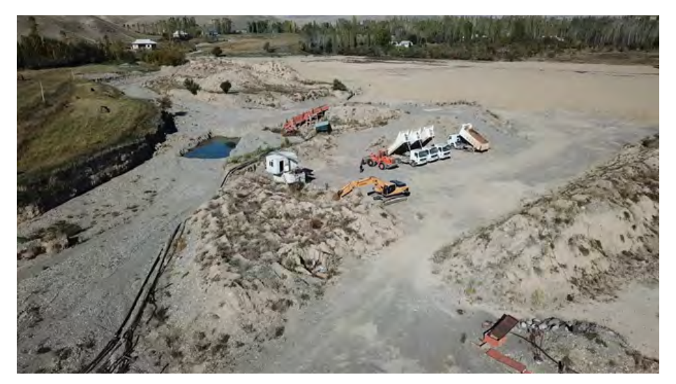
A mining site in Ala Buka, Kyrgyzstan.

of Public Policy and Administration (IPPA) has teamed up with the University of Oxford and the Independent Research Institute of Mongolia to address these challenges and foster trust, transparency, and cooperation between all stakeholders. With funding from the Economic and Social Research Council (UK) and Global Challenges Research Fund (GCRF), the collaborative project "Gobi Framework for Sustainable Infrastructure Partnerships" is pioneering a dispute resolution model that seeks to ensure a peaceful social fabric and inclusive economic development.