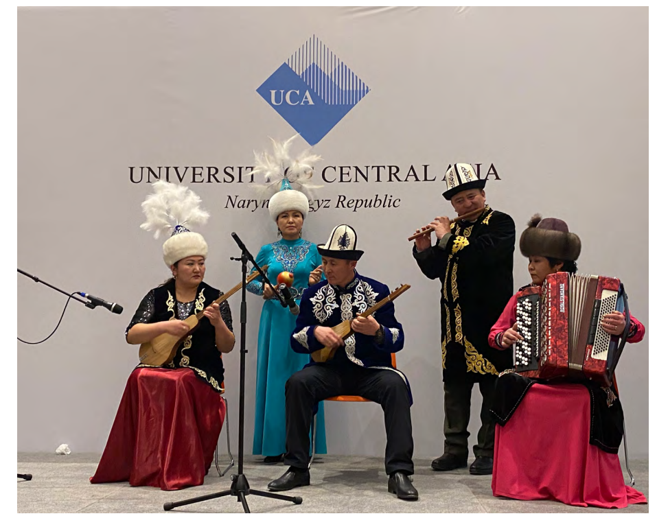
An ensemble from the Music School in Naryn playing cultural instruments on the occasion of Navruz.

Naryn Campus also hosted a fashion show representing the diverse student body at UCA. On Khorog Campus, students, staff and community members participated in competitive games including wrestling, tug of war and volleyball.