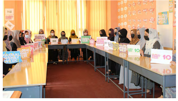
About 70% of the participants of the Financial Management Workshop in Afghanistan were women.

Various Learning Centres of UCA's School of Professional and Continuing Education celebrated Global Money Week by inviting distinguished professionals to educate students about important concepts of financial literacy, family budgeting, and related topics.