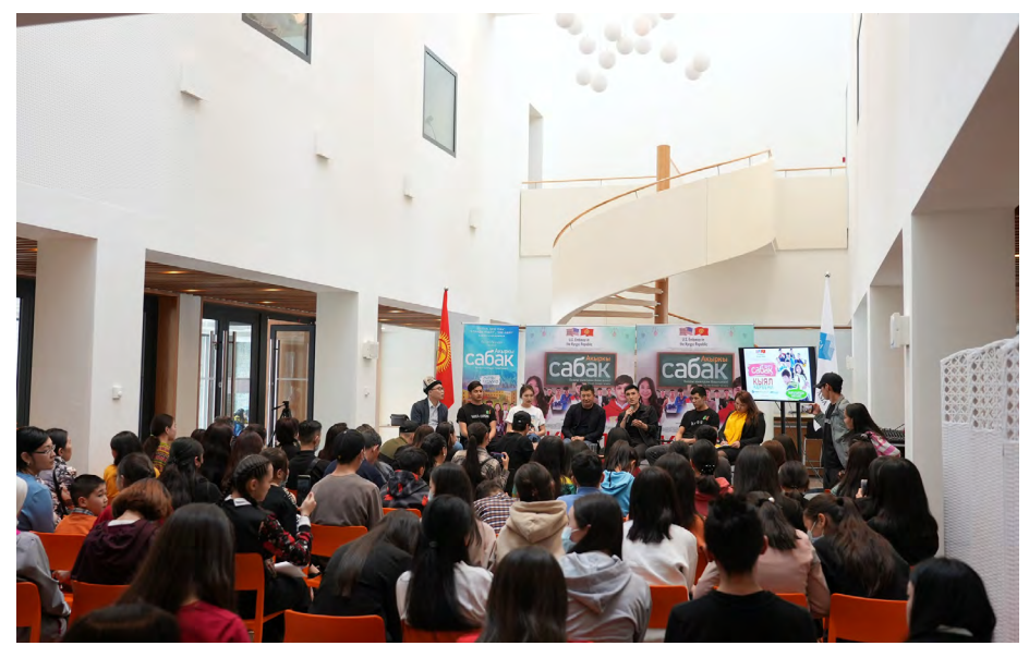
The cast of Akyrky Sabak at UCA's Naryn Campus urging high school students on the importance of pursuing higher education.

Finally, a show which young and old can watch together as a family. Ruslan Akun's new 10-part drama series, Akyrky Sabak (Final Lesson), has become popular overnight in Kyrgyzstan, and currently has 18.8 million views on YouTube, and another 14 million live views on the national TV channel, KTRK.