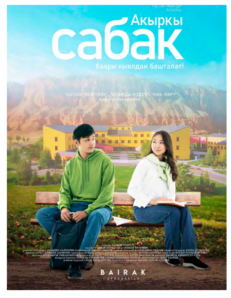
Poster of "Final Lesson" with UCA in the background.

The show also prompted discussion in the Kyrgyz Parliament, and various ministers were given assignments to help resolve social issues highlighted by the series.