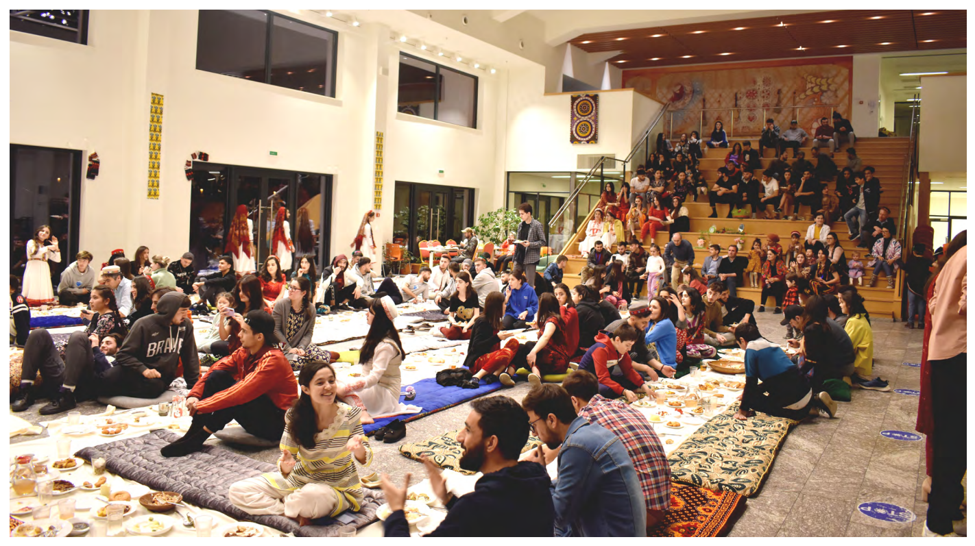
Participants gather to enjoy dinner and performances during the celebratory event of Navruz at the Khorog Campus.

Celebrated in Iran for over 3,000 years, the festival of Navruz signifies the arrival of Spring as a victory over darkness. The festival survived several conquests of Persia and spread across the globe through the diaspora of Persian people. Navruz signifies a time of spiritual renewal and physical rejuvenation as well as an outlook of hope and optimism in life. The end of harsh winters and beginning of new life cycle on earth is celebrated across all Central Asian countries.