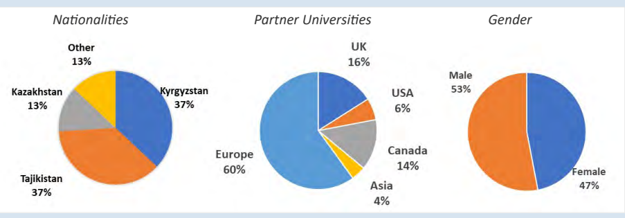
CAFDP: 64 Fellows in 30 Universities

Over a short span of time, UCA has managed to build solid relationships with some of the finest universities in the world including the universities of Cambridge, Oxford, Harvard, where UCA fellows and faculty have studied.